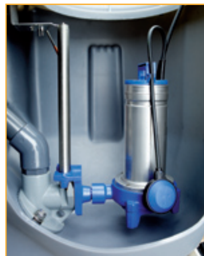
Stationary wet installation directly to a discharge connection using guide bars when fitted with a sliding bracket. Here in a Flygt Micro 7 station.