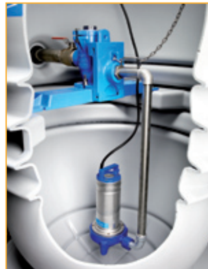
Stationary installation suspended from a discharge pipe and fitted with an outlet bend. Here in a Flygt Compit station.